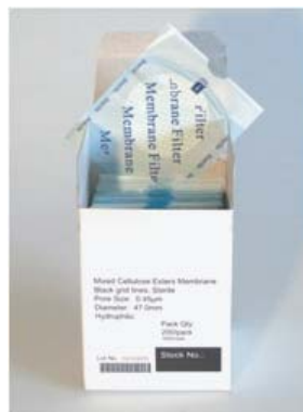
Sterile version membranes are individually sealed in easy to open pouches