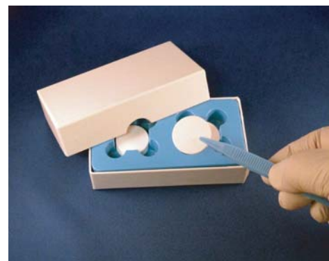
Non-sterile version is stacked in notched thermoformed trays designed for easy removal using forceps.