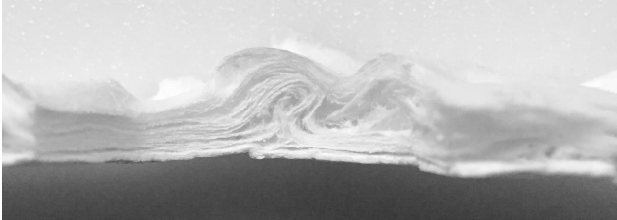
Cross section of the new IW Tremont Multi-Density Filter Disk

Introducing the IW Tremont Multi-Density filter disk. This exciting new product is a 100% borosilicate binderless glass microfiber filter which demonstrates several layers of density along with a unique surface formation that speeds and optimizes filtration. These filter disks can handle sample preparation tasks typically considered too challenging for other analytical filter products. This unique product bridges the gap between macro and micro analytical filtration.